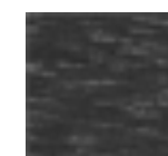
Black PMS BLACK C