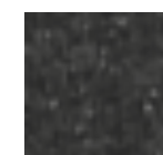
Charcoal Heather PMS 426C